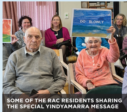
SOME OF THE RAC RESIDENTS SHARING THE SPECIAL YINDYAMARRA MESSAGE